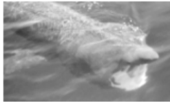
mouth open = animal is filter feeding