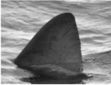
large, triangular dorsal fin visible at surface