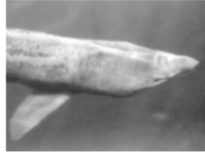
mouth closed – not feeding