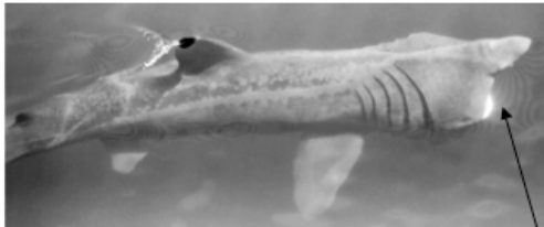
Basking shark swimming just beneath the water's surface and only tip of dorsal fin is showing. You can see the greenish-white patch near mouth indicating that the basking shark is feeding.