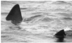
both dorsal fin + caudal (tail) fin visible